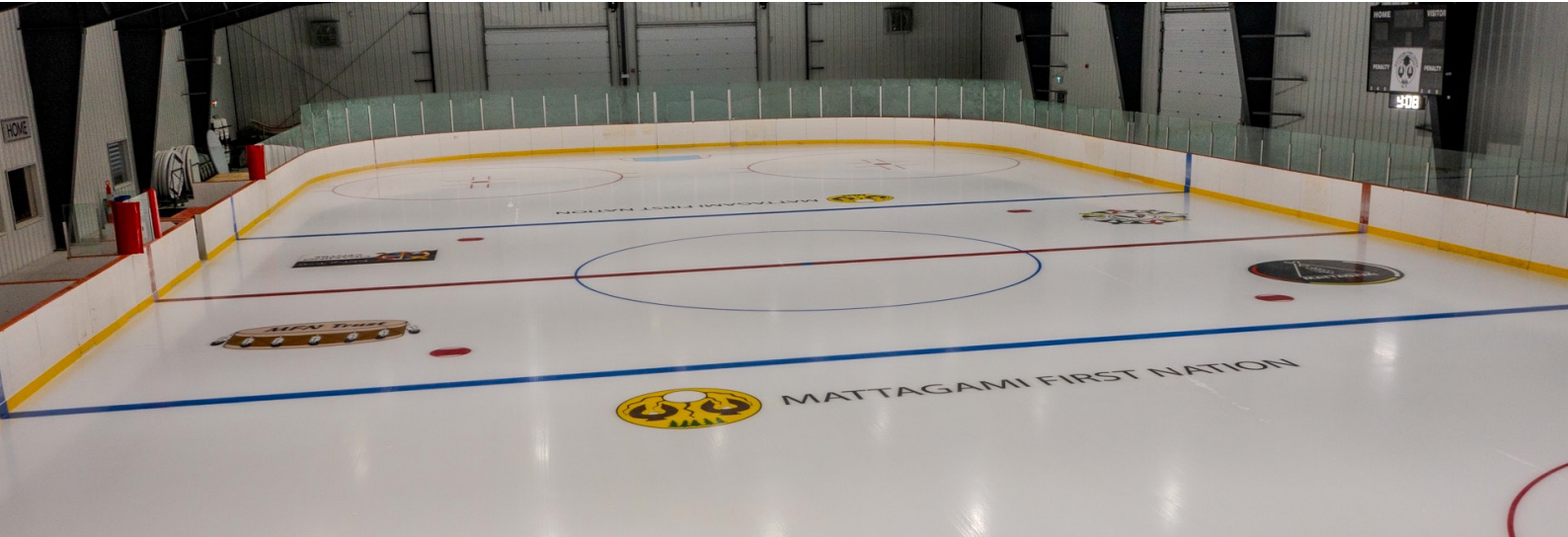
Freshly installed ice at the Mattagami First Nation community rink, preparing the arena for the 2025–2026 winter season.